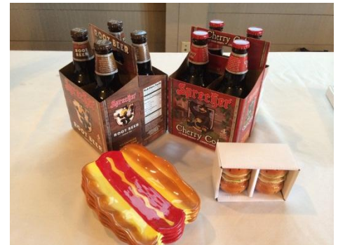
Prizes Courtesy of Kari