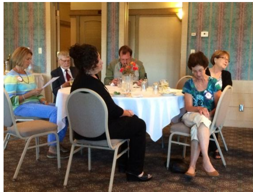
Our Evening Meeting