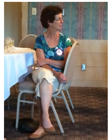
First Lady Holly Wagner