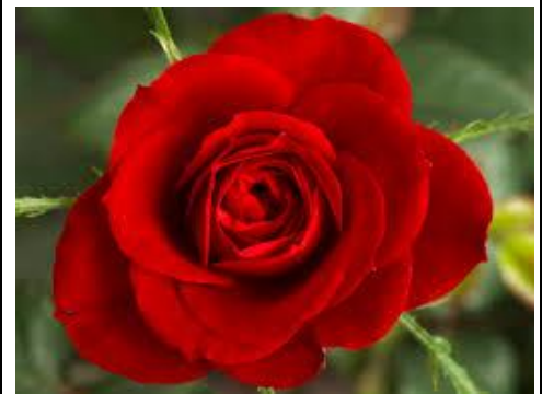
It's Go Time