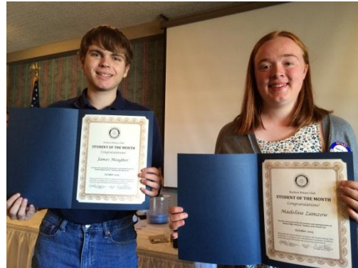
Students of The Month