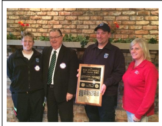
2015 O'Connell Award