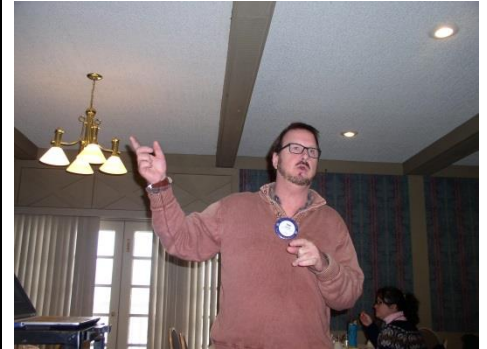
LFL Program By Todd