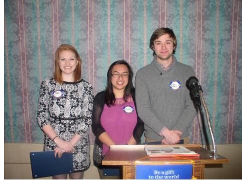
Students Of The Month