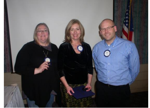
Paul Harris Fellows