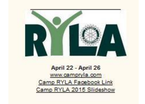
RYLA Camp St Croix April 22-26