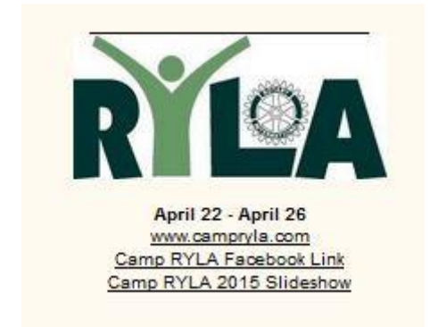
RYLA Camp St Croix April 22-26