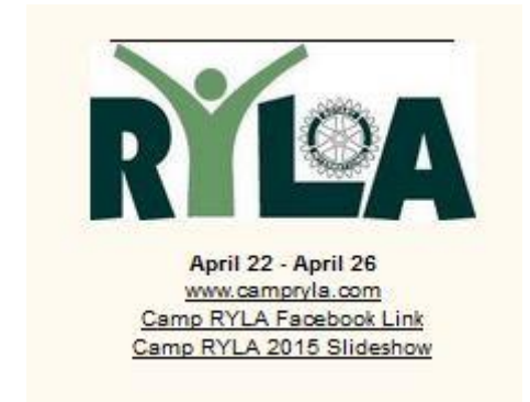
RYLA Camp St Croix April 22-26